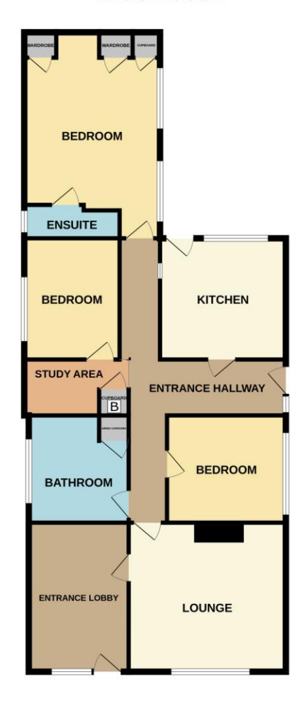
TOTAL FLOOR AREA: 1191 sq.ft. (110.6 sq.m.) approx. every attempt has been made to ensure the accuracy of the floorplan contained here, measuremenys, windows, comes and any other tiens are approximate and no responsibility is taken for any error solon or mis-statement. This plan is for illustrative purposes only and should be used as such by any city or control to the services systems and accollarors shown have not been lested and no quarant

GROUND FLOOR 1191 sq.ft. (110.6 sq.m.) approx.