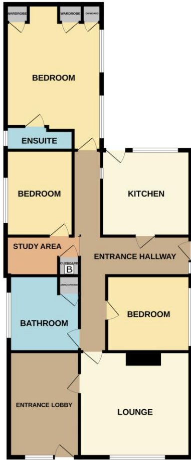
TOTAL FLOOR AREA : 1191 sq.ft. (110.6 sq.m.) approx.

Whilst every attempt has been made to ensure the accuracy of the floorplan contained here, measurements of doors, windows, rooms and any other items are approximate and no responsibility is taken for any error, omission or mis-statement. This plan is for illustrative purposes only and should be used as such by any prospective purchaser. The services, systems and appliances shown have not been tested and no guarantee as to their operability or efficiency can be given. Made with Metropix ©2024