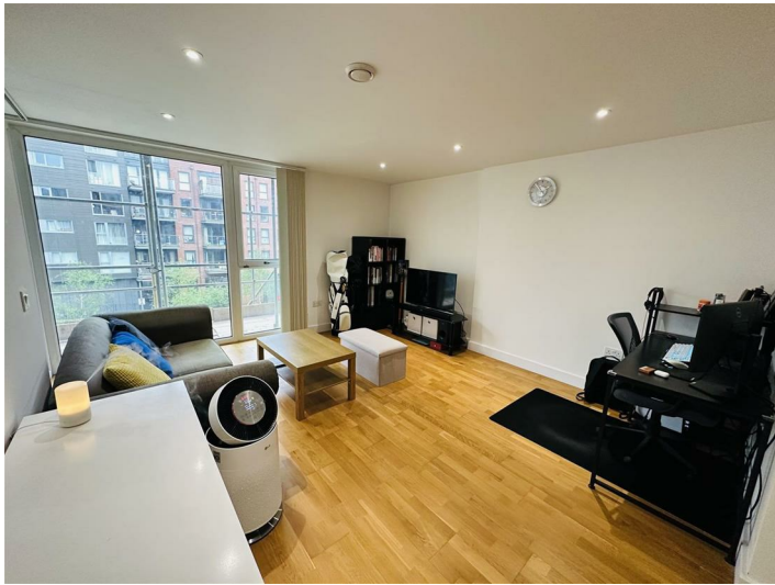
Living Room 15'3 x 11'4 (4.65m x 3.45m )