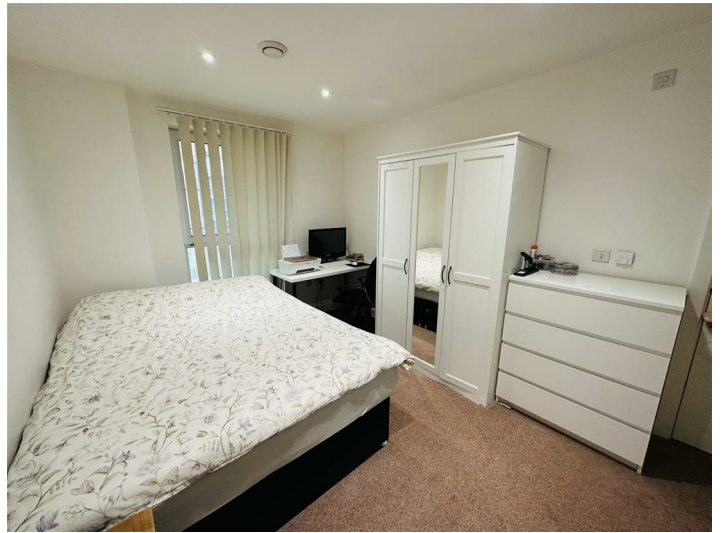
Bedroom 14'0 x 9'5 (4.27m x 2.87m)