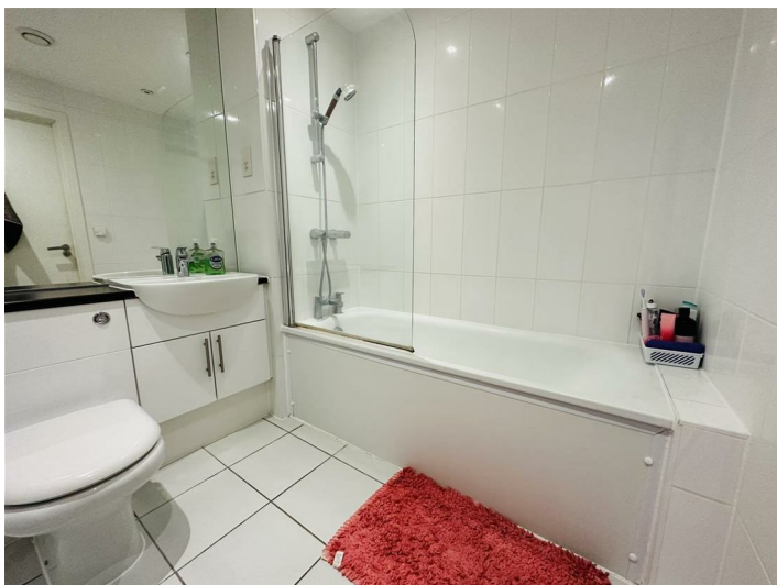
Bathroom 6'9 x 5'9 (2.06m x 1.75m)