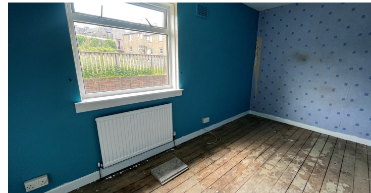
3 Providence Brae