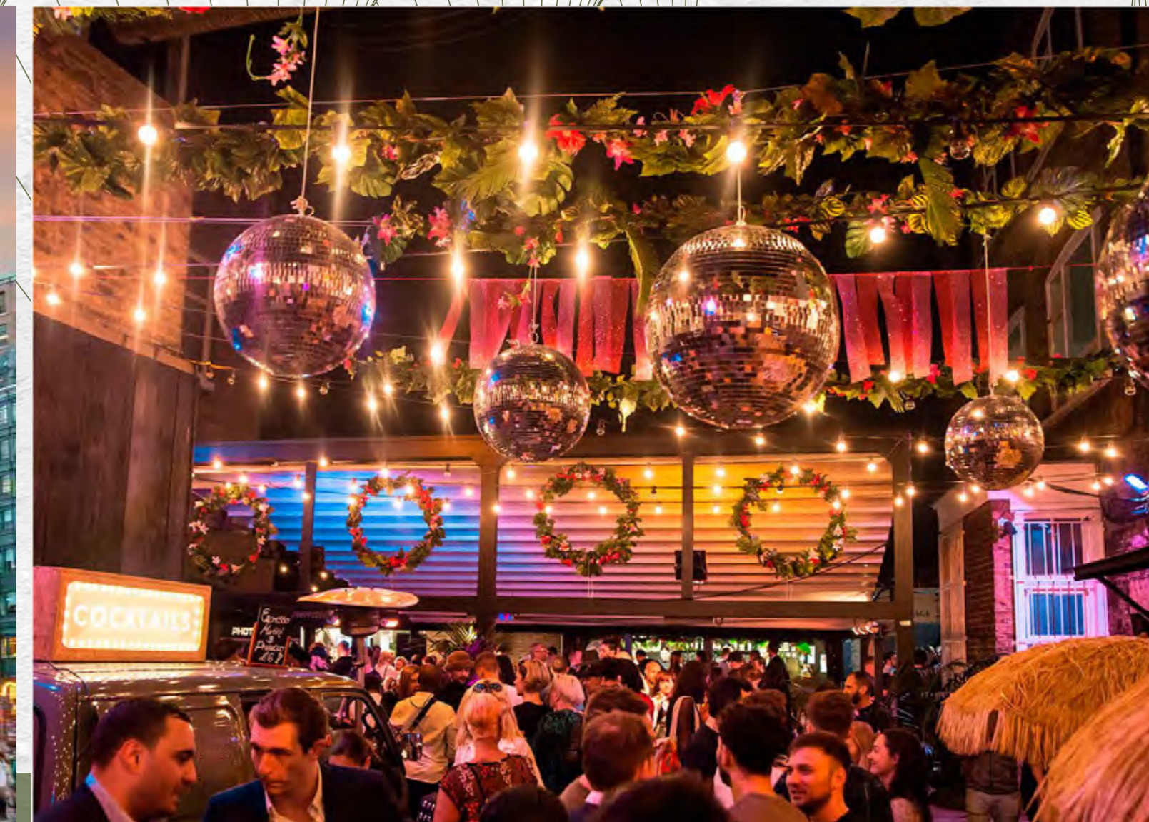
Paradise Alley, Brick Lane