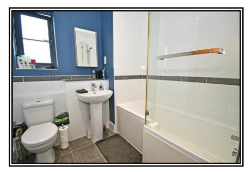
<u>QUALITY FITTED BATHROOM</u> 7'3 x 7'1 Partly tiled with contemporary suite comprising; wash hand basin with chrome mono-bloc tap, close coupled w.c. and p-shaped bath with mixer tap and independent thermostatically controlled shower and glazed screen. Obscure double glazed window to side, extractor fan, recess LED lighting, shaver point, chrome heated towel rail and tiled flooring.