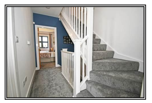
<u>LANDING</u> Turning staircase to second floor and doors to bedroom and bathroom.