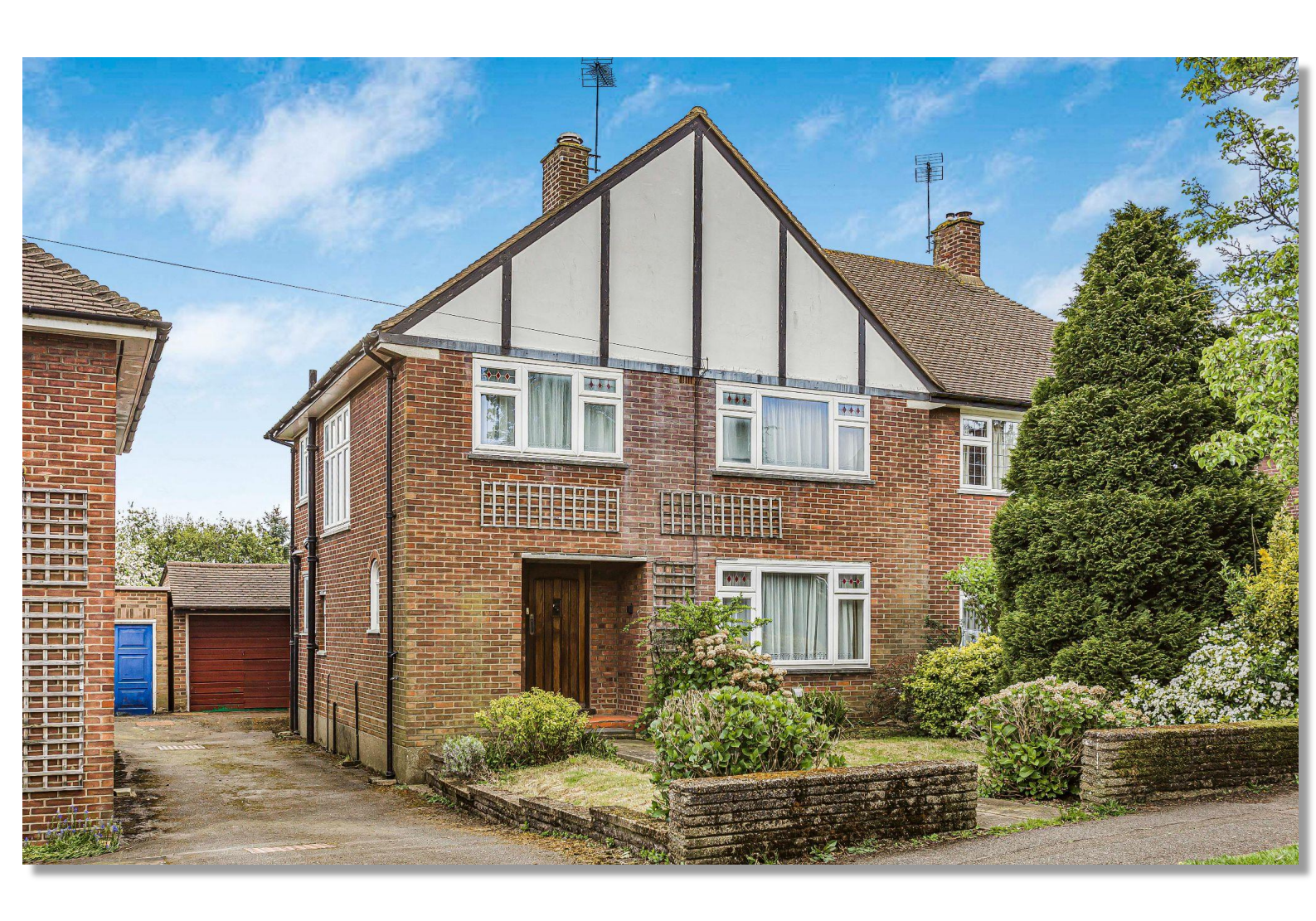
** CHAIN FREE **

Vanessa McCallum Estates Ltd Maple House, High Street, Potters Bar, Hertfordshire., EN6 5BS Tel: 01707 320432 Email: sales@vanessamccallumestates.co.uk www.vanessamccallumestates.co.uk