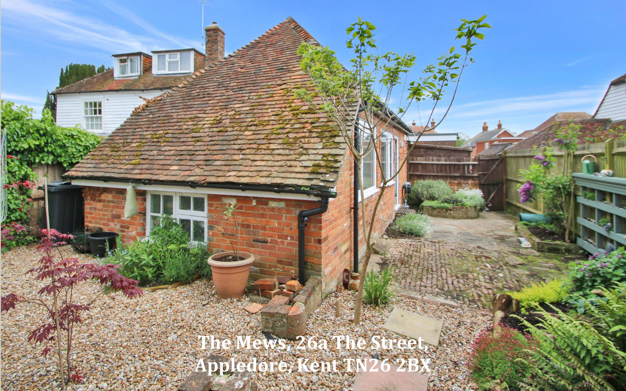
The Mews, 26a The Street, Appledore, Kent TN26 2BX