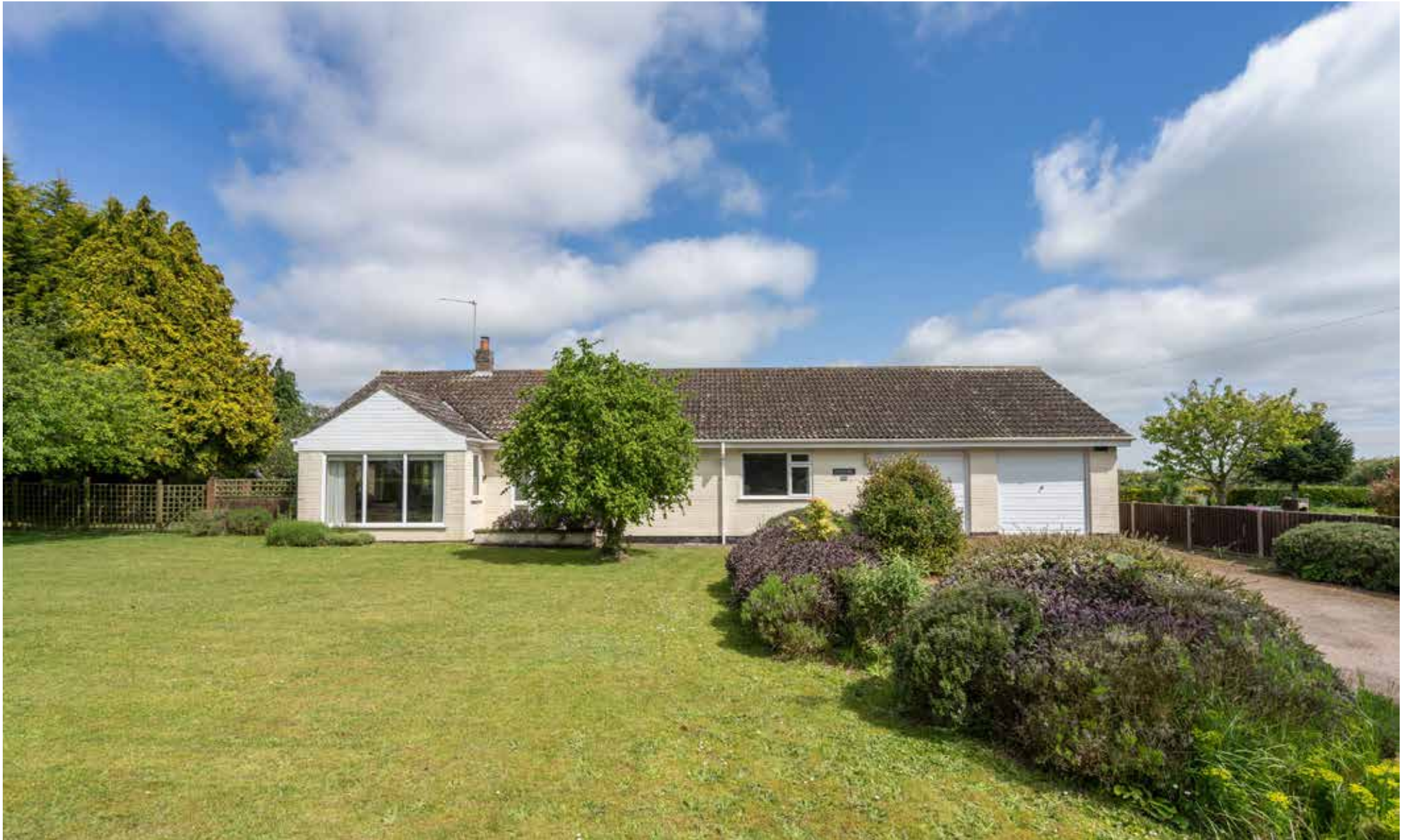
River Hill 13 Holly Farm Road | Reedham | Norfolk | NR13 3TH