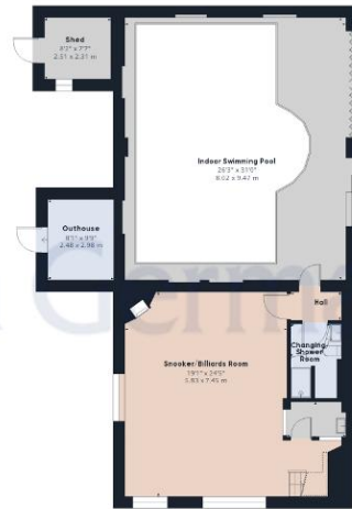
Floor -1 Building 1