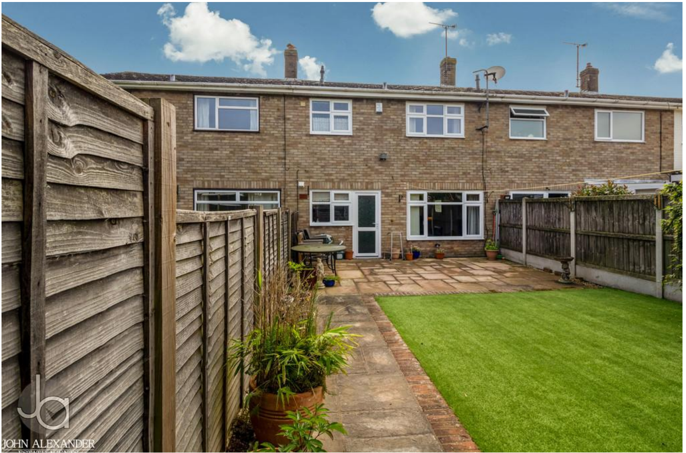
Glebe Road, Tiptree CO5 0SZ