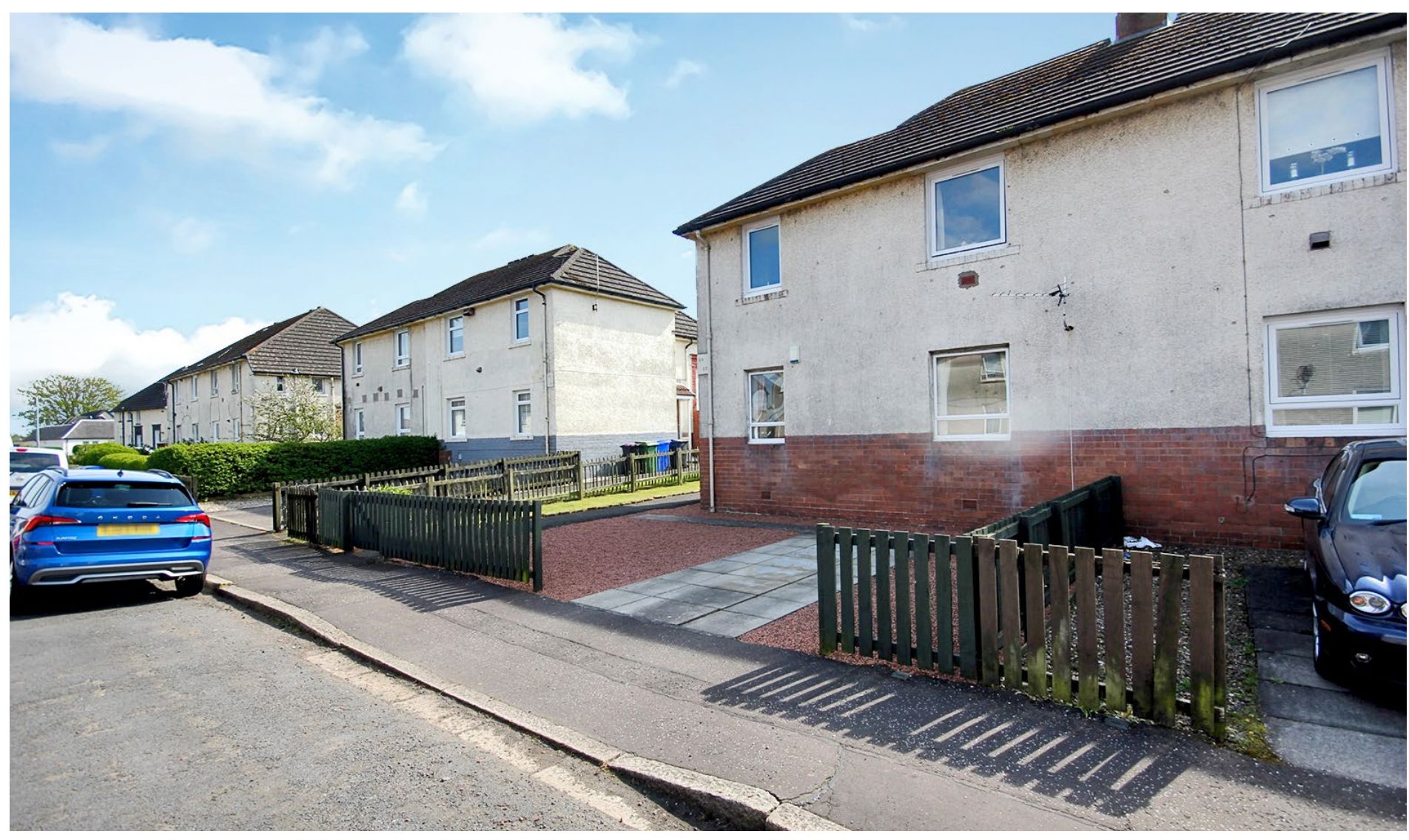
17 Manson Avenue, PRESTWICK KA9 1EZ Offers Over £60,000