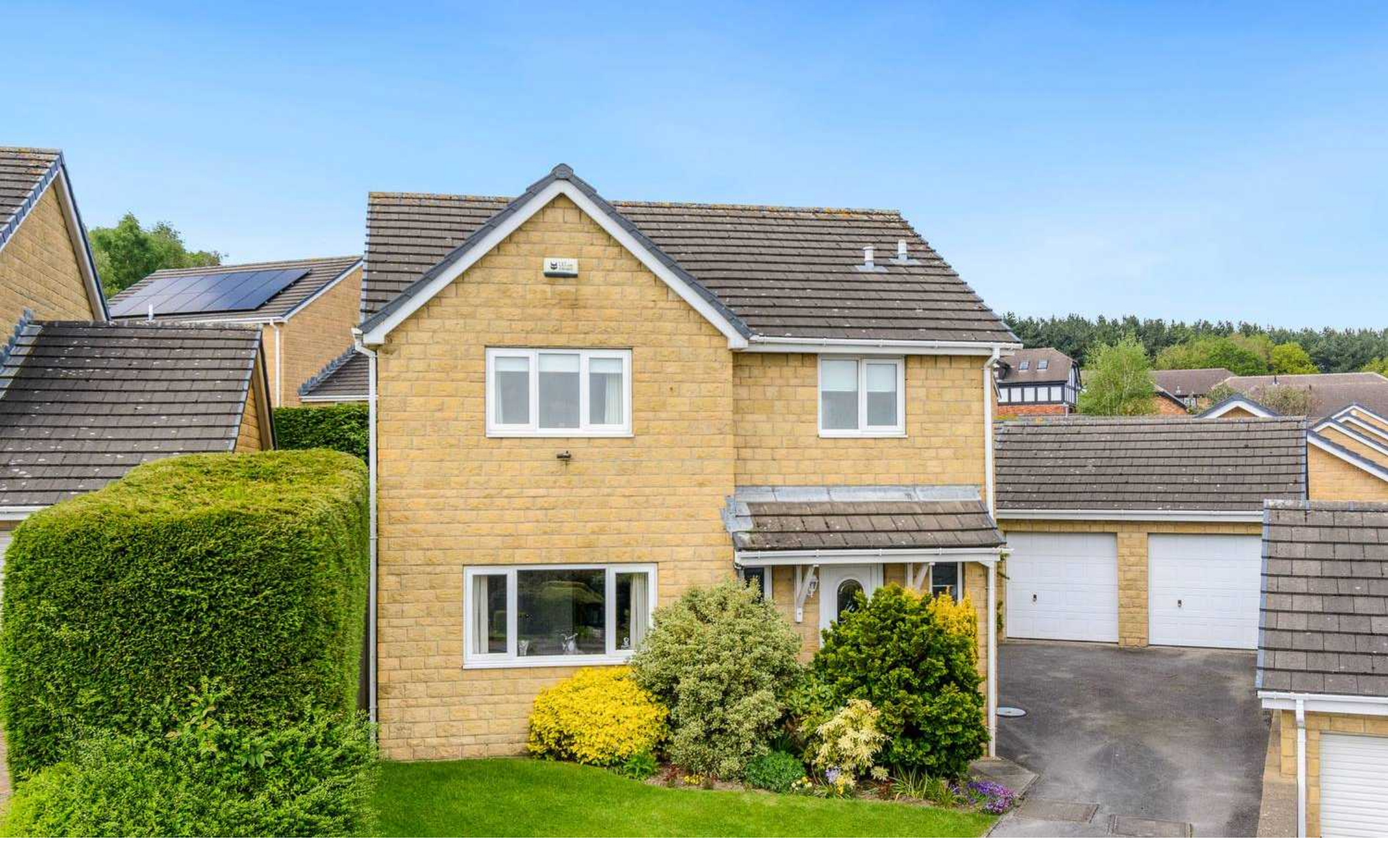
32 Gleneagles Way, Huddersfield