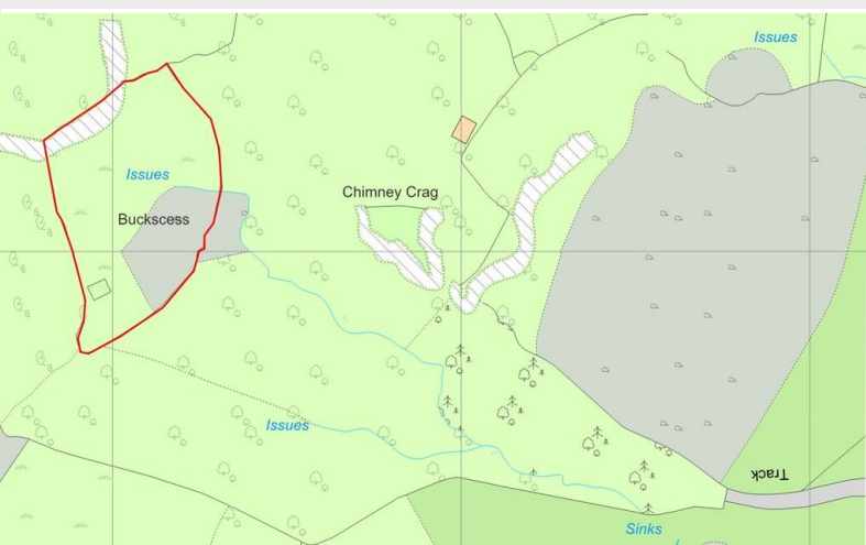
OS Plan Land

the buttery and parlour is also original. The house was restored by a builder with deep knowledge and love of old buildings.