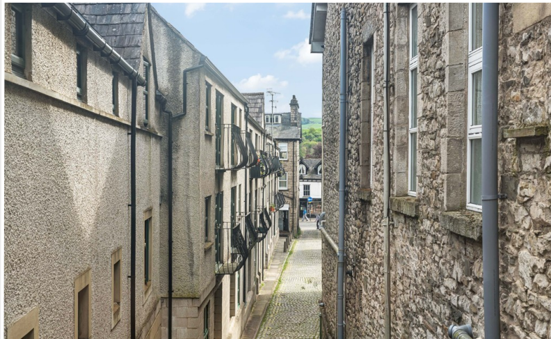
Views down the alley