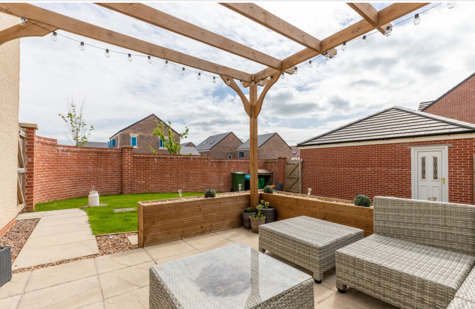
Patio and Garden