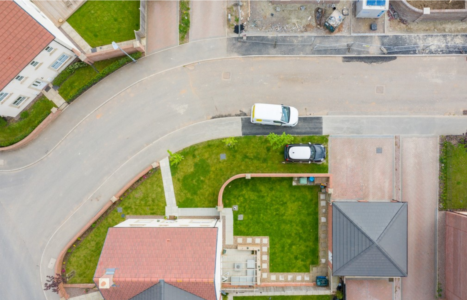
60 Tulip Gardens