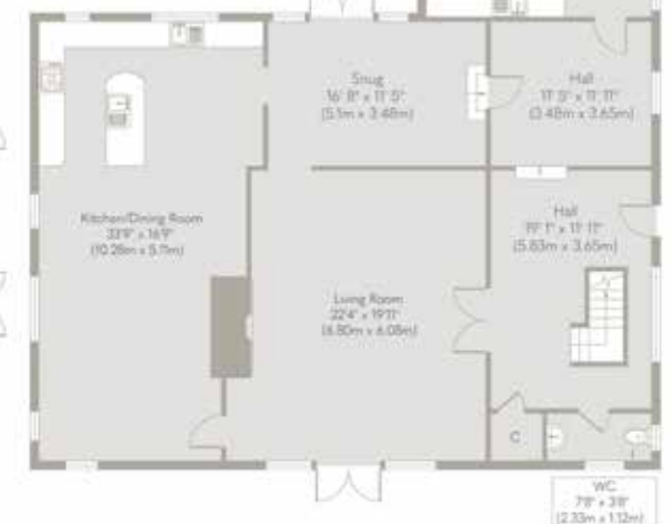
Ground Floor Approximate Floor Area 2650 sq. ft. (246.17 sq. m)

Whilst every attempt has been made to ensure the accuracy of the floor plan contained here, measurements of doors, windows, rooms and any other items are approximate and no responsibility is taken for any error, omission, or mis-statement. This plan is for illustrative purposes only and should be used as such by any prospective purchaser or tenant. The services, systems and appliances shown have not been tested and no guarantee as to their operability or efficiency can be given.