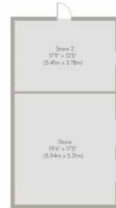
Outbuilding Approximate Floor Area 572 sq. ft. (53.12 sq. m)