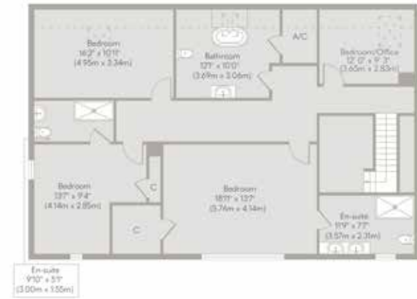
First Floor Approximate Floor Area 1425 sq. ft. (132.35 sq. m)