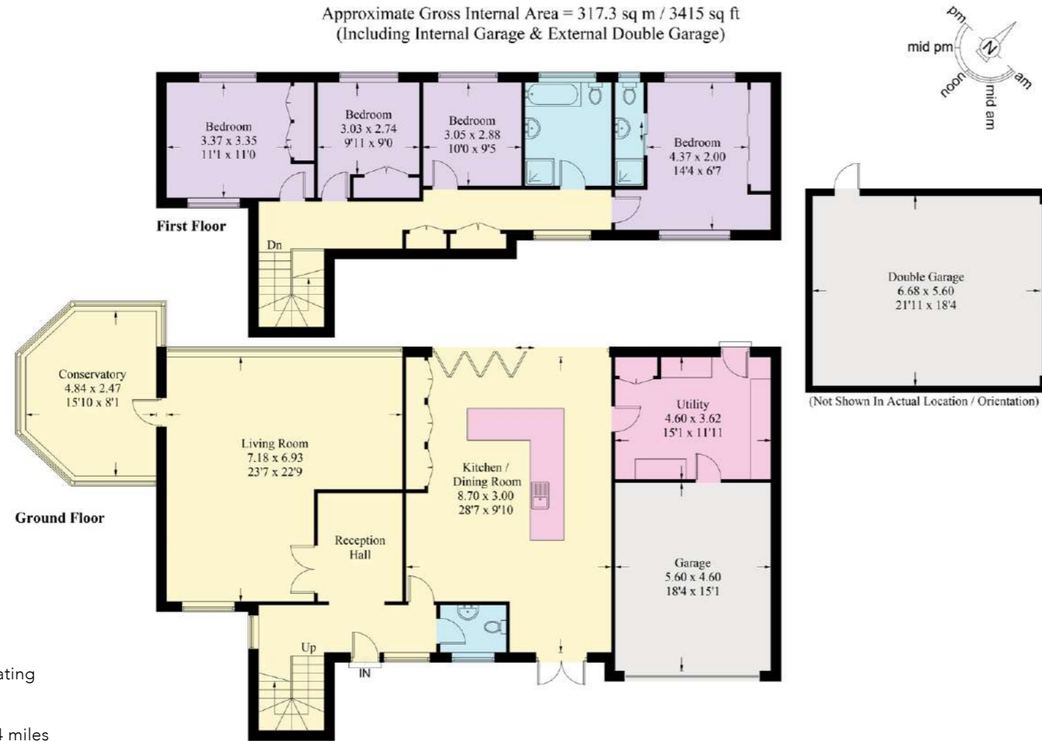
Illustration for identification purposes only, measurements are approximate, not to scale. floorplansUsketch.com © (ID1080891)