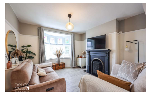
Moor Lane Bolehall, Tamworth, B77 3LJ