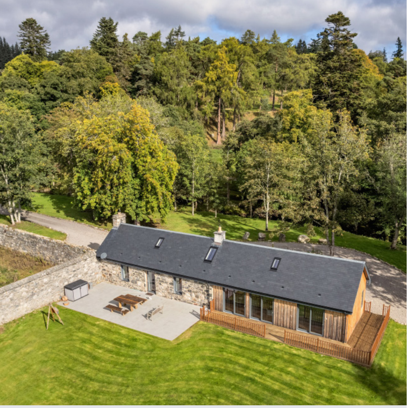
This detached stone built cottage was recently renovated and extended with a timber clad extension and insulated pitch roof. It is located in a lovely position next to Raitts Burn and the walled garden, overlooking an extensive grass and wooded area.

Extending to a total floor area of 121m2 and with an EPC rating of band D, this is currently occupied by the head game keeper.