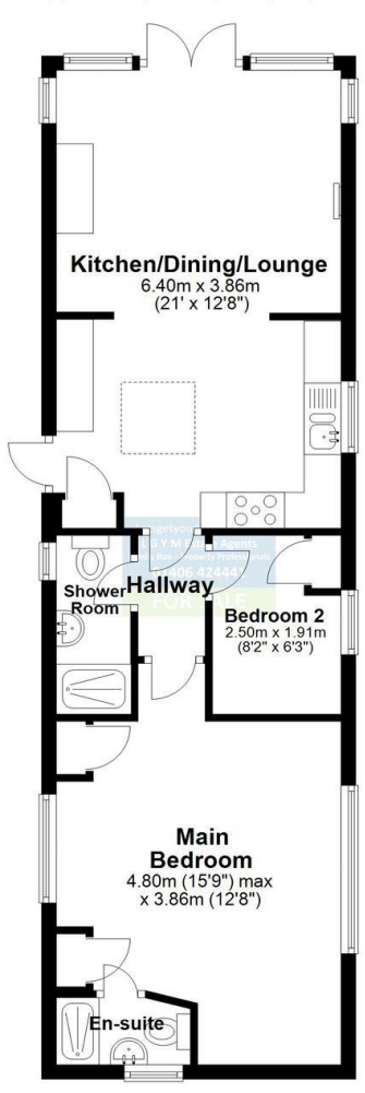
Total area: approx. 54.1 sq. metres (582.0 sq. feet)

Approx. 54.1 sq. metres (582.0 sq. feet)