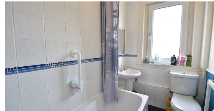
108 Dean Road