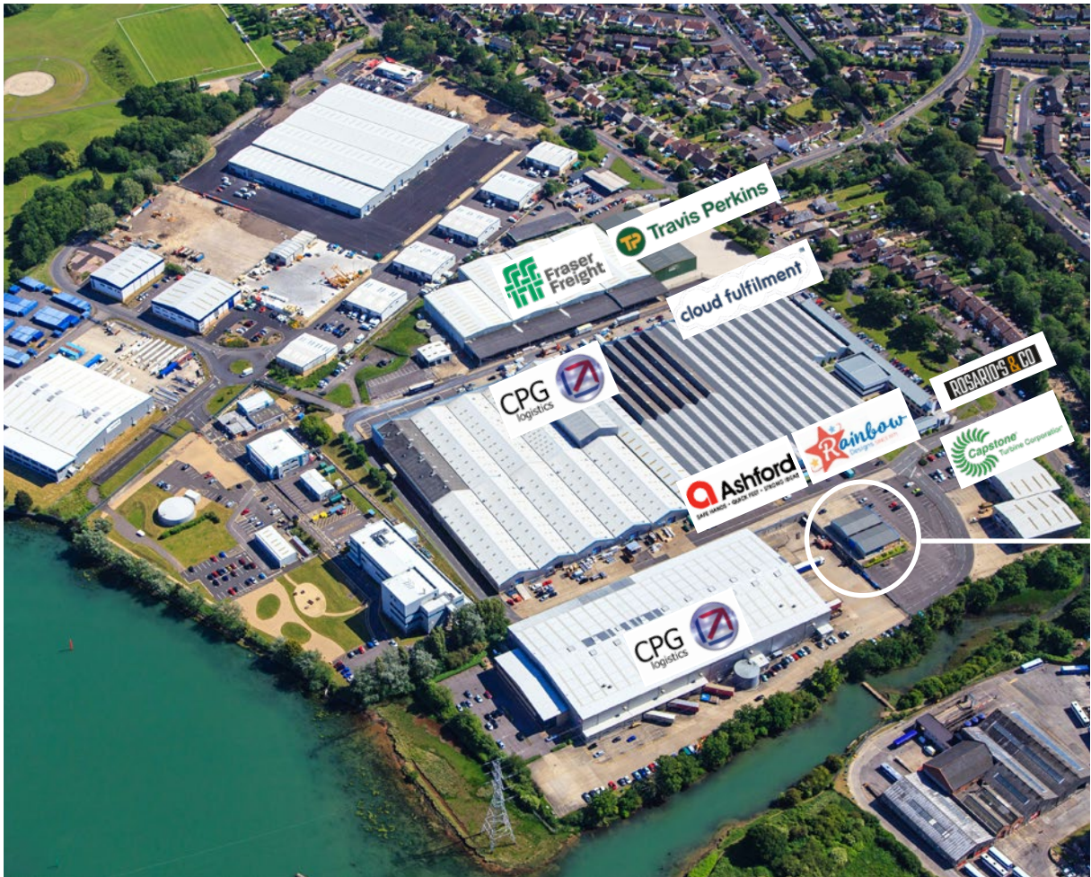
Aerial photograph of Fareham Reach Business Park looking south west.