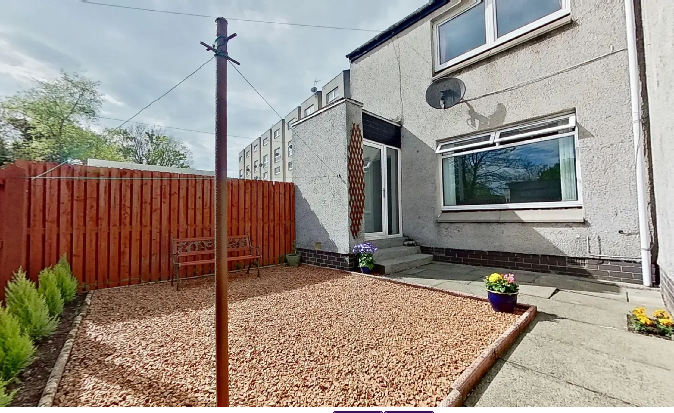
64 Almondell Road, Broxburn Offers Over £143,000