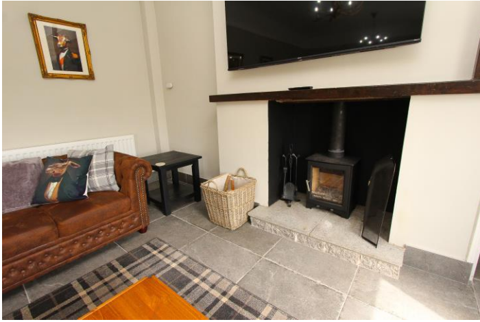
Further lounge image