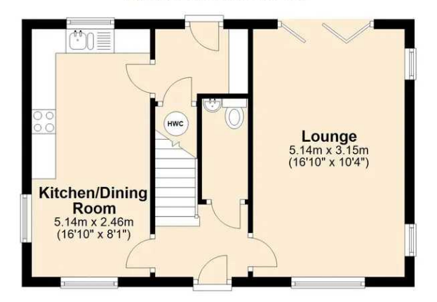
Ground Floor Approx. 39.7 sq. metres (427.8 sq. feet)