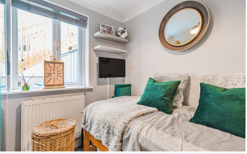
Bedroom Four/Home Office