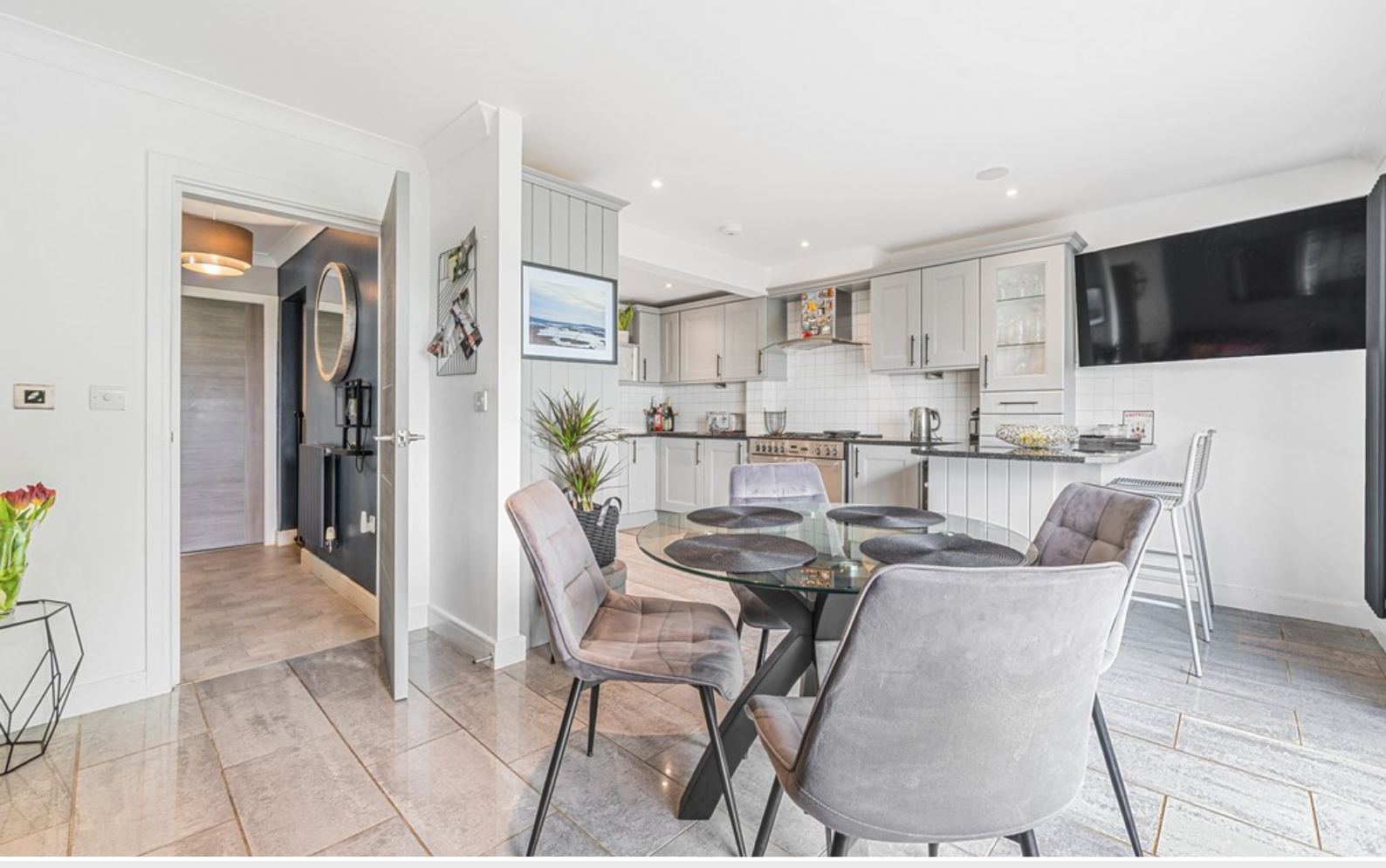
L-shaped Dining Kitchen