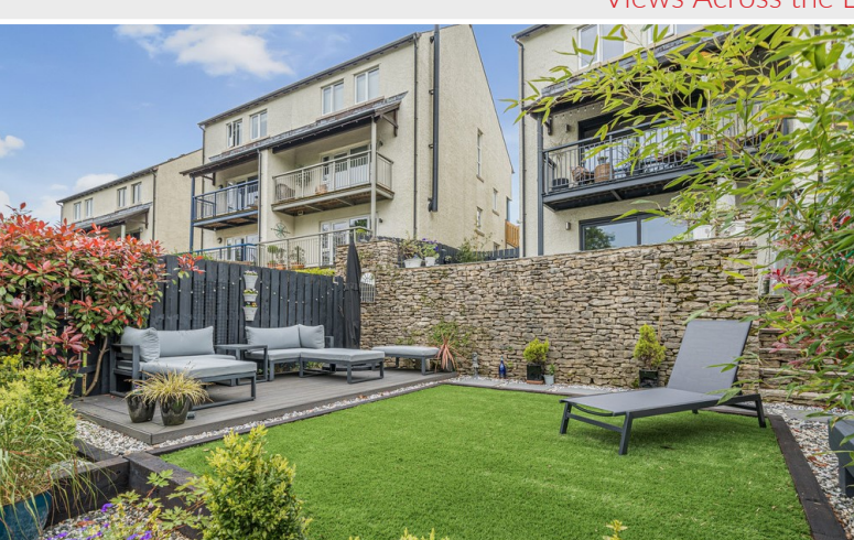
Rear Landscaped Garden