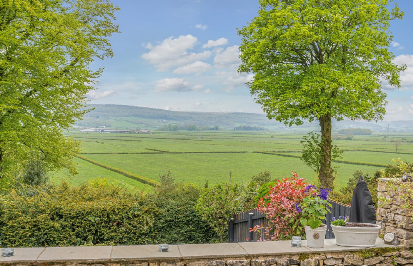
Views Across the Lyth Valley & Beyond!