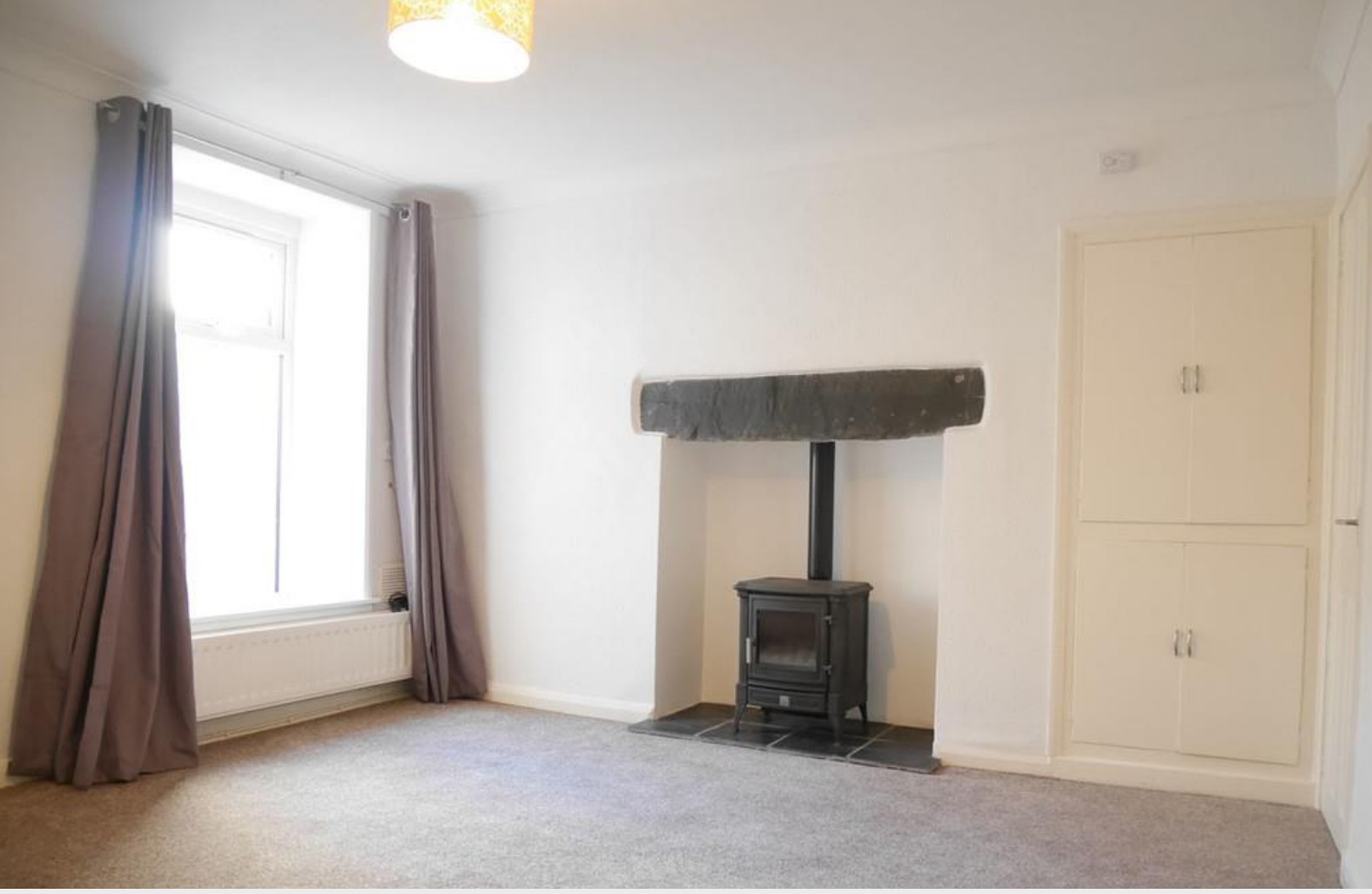
Back reception room

Location: From Ulverston take the A590 to Dalton-in-Furness. Queen Street is located on the right just after The Clarence Public