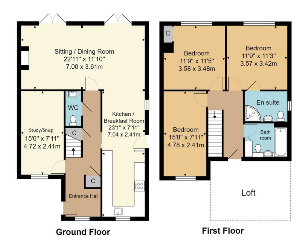
Approx. Gross Internal Area 1336 ft<sup>2</sup> ... 124.1 m<sup>2</sup>

Whilst every attempt has been made to ensure the accuracy of the floor plan contained here, measurements of doors, windows, rooms and any other items are approximate and no responsibility is taken for any error, omission, or mis-statement. This plan is for illustrative purposes only and should be used as such by any prospective purchaser or tenant. The services, systems and appliances shown have not been tested and no guarantee as to their operability or efficiency can be given.