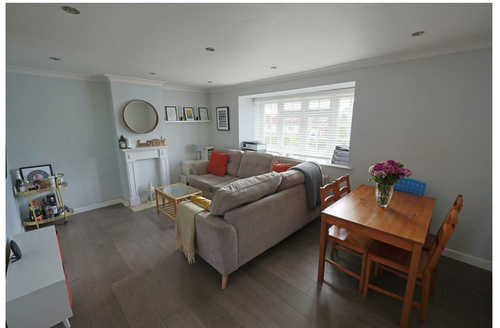
Reception 16'2" x 11'2" (4.94m x 3.42m)