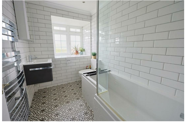
Family Bathroom 8'2" x 5'6" (2.49 x 1.69)