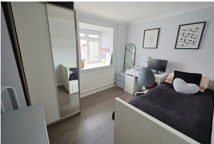
Bedroom Two 10'7" x 8'2" (3.23 x 2.49)