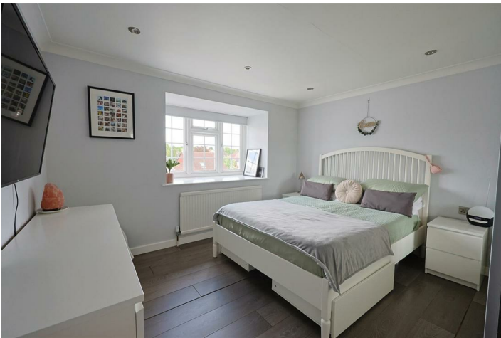
Bedroom One 12'3" x 11'6" (3.73m x 3.51m)