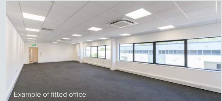
Example of fitted office

Units are available to lease on terms to be agreed.