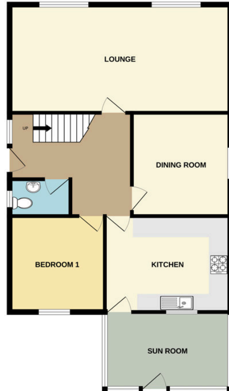
GROUND FLOOR 861 sq.ft. (80.0 sq.m.) approx.