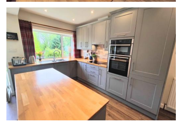
From the hallway a wooden door opens into the