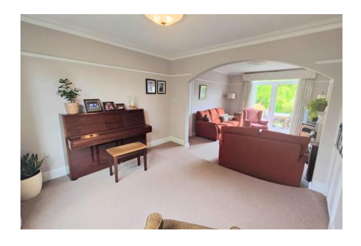
From the hallway a wooden door opens into the