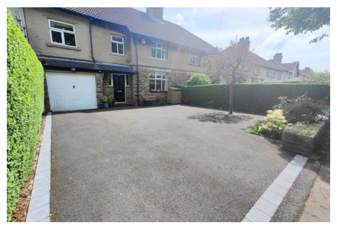
To the front of the property there is a tarmac forecourt that can provide parking for 3+ cars.