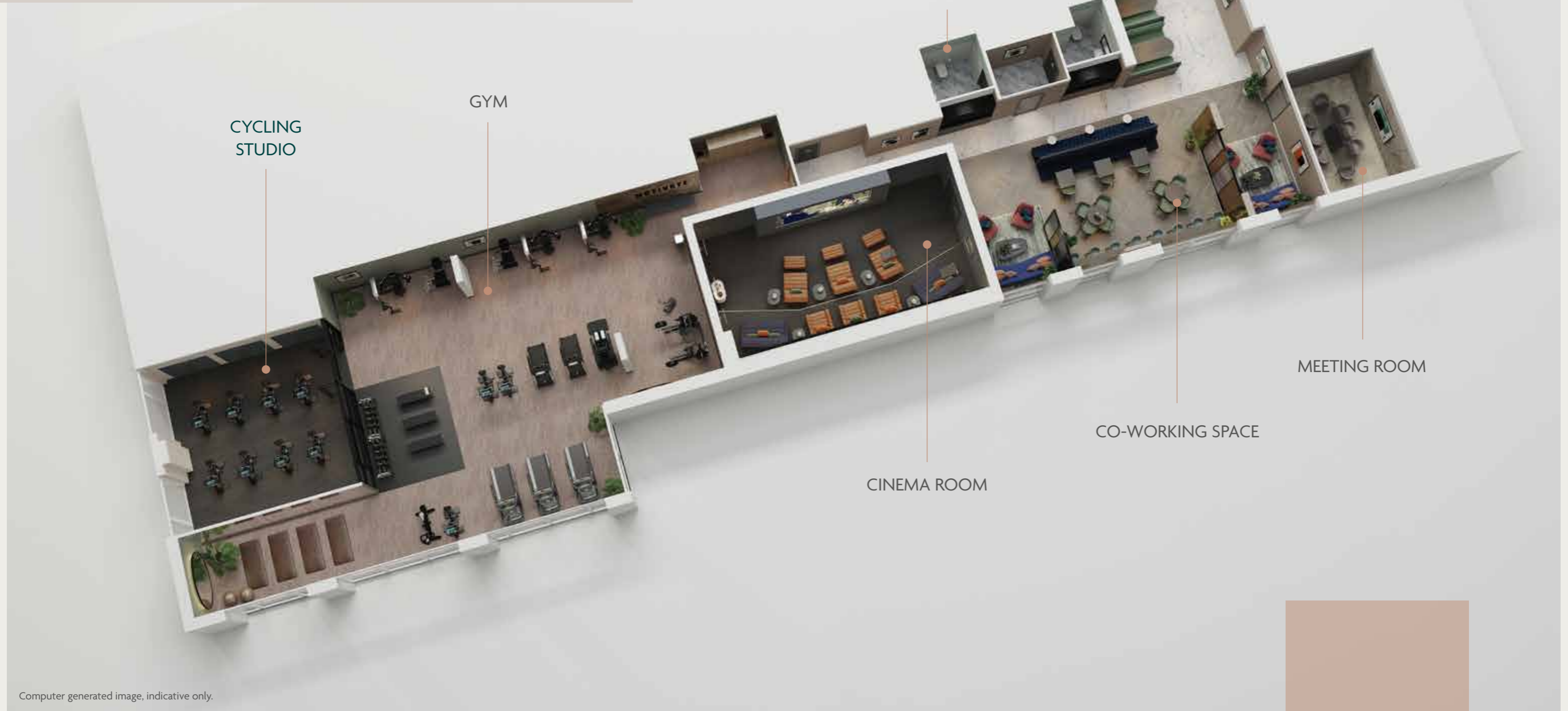
Computer generated image, indicative only.

Residents will have exclusive use of a fantastic range of amenities, including a 24-hr concierge, co-working space, private gym and cinema room.