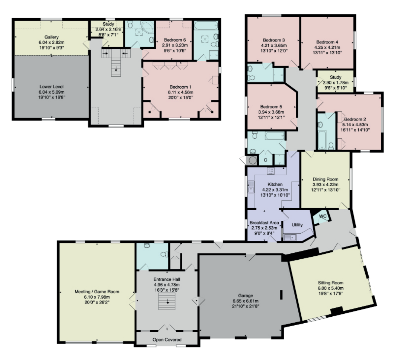
Total Area: 466.2 m<sup>2</sup> ... 5018 ft<sup>2</sup>

All measurements are approximate and for display purposes only. No liability is accepted by either the agency or Box Property Solutions Ltd as to the exact measurements of the rooms. Box Property Solutions Ltd retains the copyright on this plan and allows agents to use it with agreed permission.