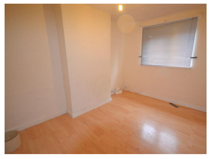
FRONT GARDEN A low maintenance style garden with LOUNGE 12" 5"" x 9" 0" (3.78m x 2.74m) The lounge is with picket style fencing and gate.

INNER HALLWAY The entrance to the home is from the side aspect and opens to the inner hallway which in turn gives access to each of the rooms