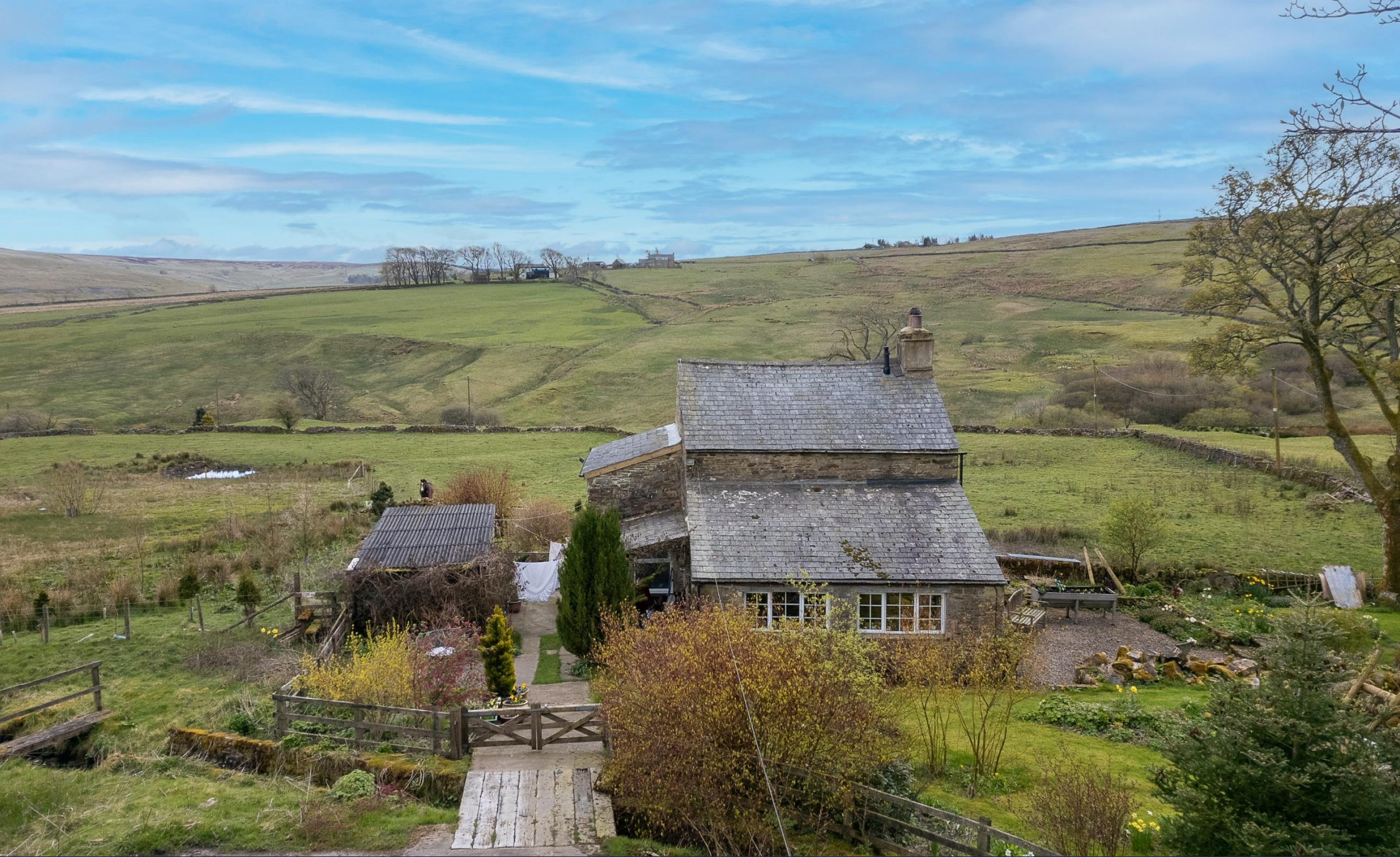
High Swinhope Mill Cottage Sparty Lea, Hexham, NE47 9UP