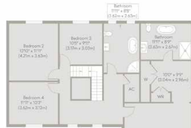
First Floor Approximate Floor Area 1247 sq. ft. (115.80 sq. m)