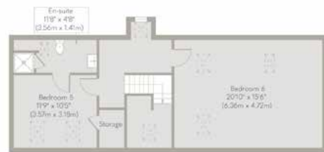
Second Floor Approximate Floor Area 690 sq. ft. (64.08 sq. m)