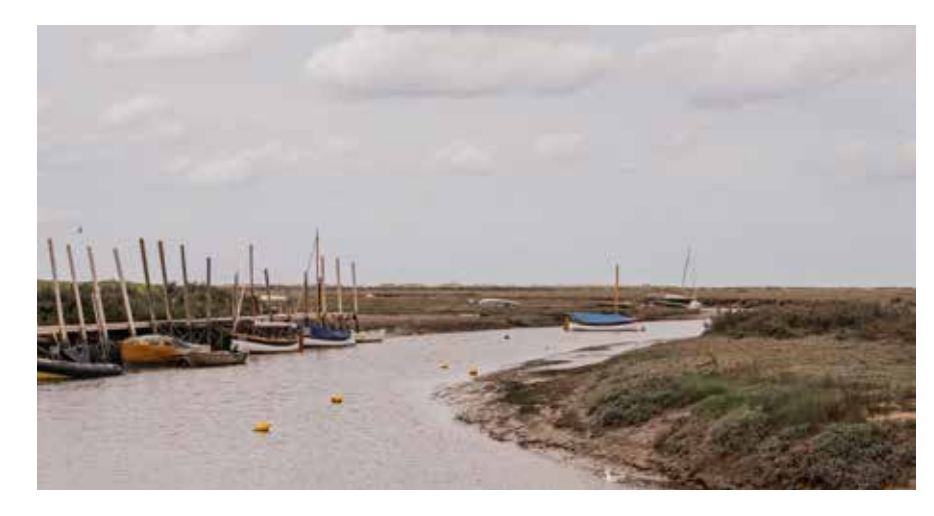
Short description of where the photograph is here

"The walks between Blakeney, Cley and Morston are some of the best in the county."