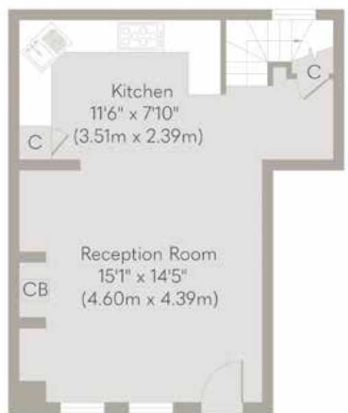
Ground Floor Approximate Floor Area 397 sq. ft (36.83 sq. m)

Whilst every attempt has been made to ensure the accuracy of the floor plan contained here, measurements of doors, windows, rooms and any other items are approximate and no responsibility is taken for any error, omission, or mis-statement. This plan is for illustrative purposes only and should be used as such by any prospective purchaser or tenant. The services, systems and appliances shown have not been tested and no guarantee as to their operability or efficiency can be given.