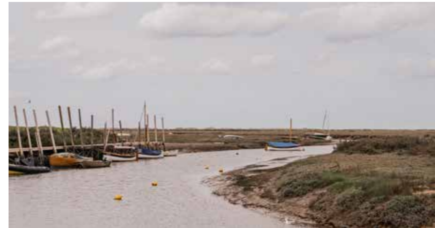
Short description of where the photograph is here.

“The walks between Blakeney, Cley and Morston are some of the best in the county.”