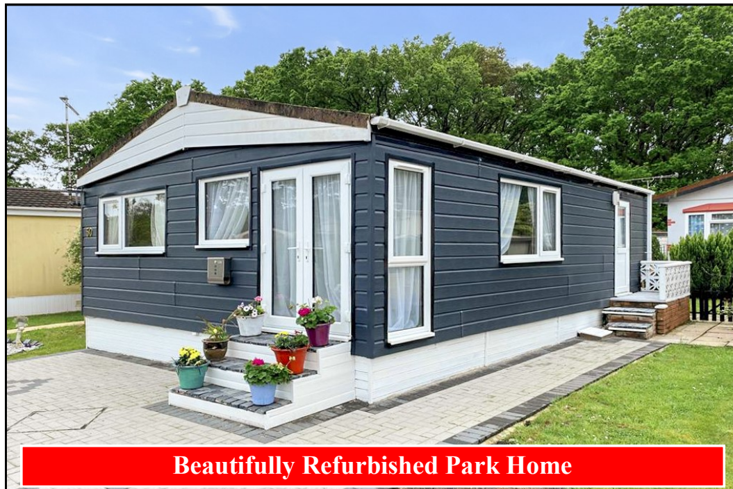
Beautifully Refurbished Park Home

50 Gladelands Park, Ringwood Road, Ferndown, Dorset. BH22 9BW