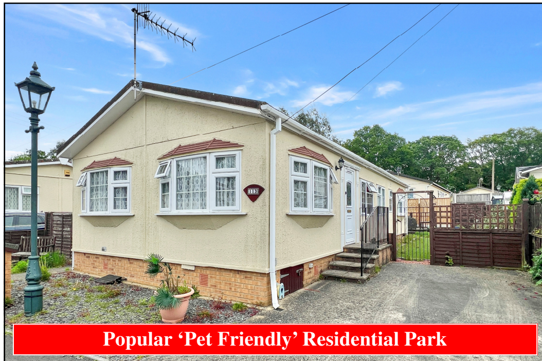
Popular 'Pet Friendly' Residential Park

113 The Square, Oaktree Park, St Leonards, Ringwood. BH24 2RL