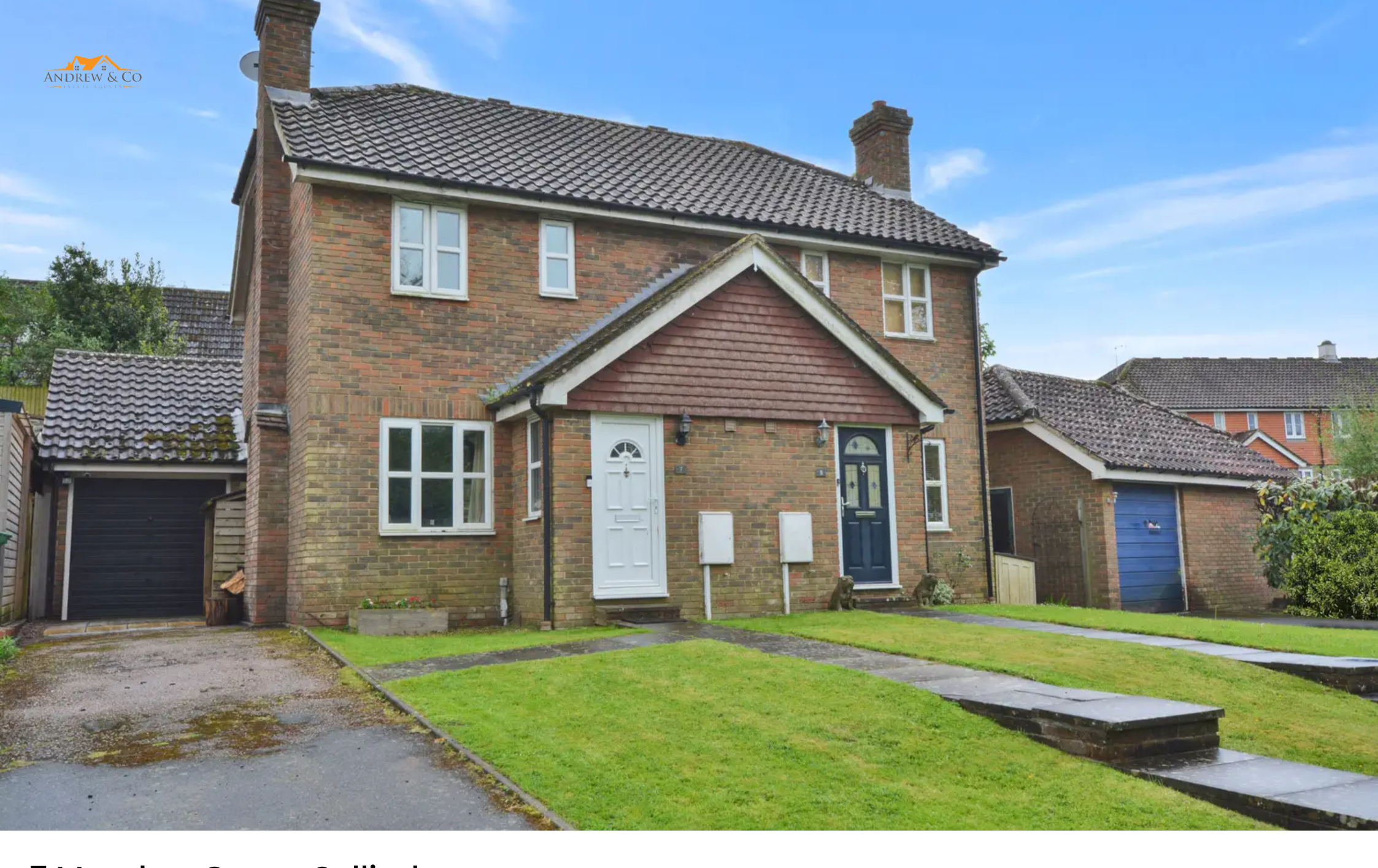
7 Meadow Grove, Sellindge Offers Over £300,000