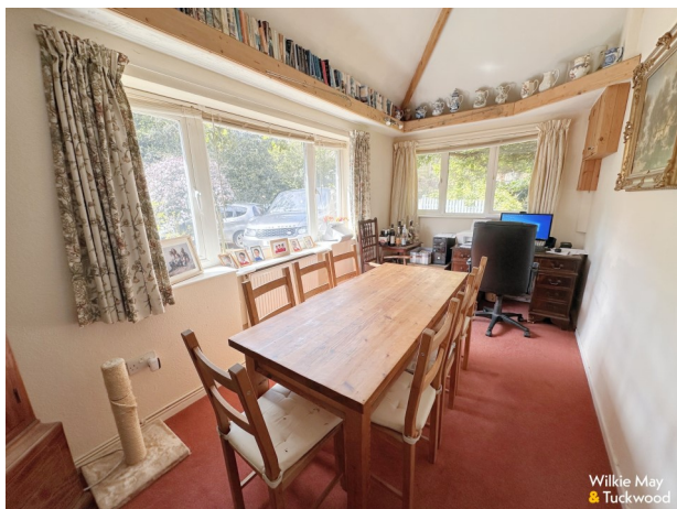
Wilkie May Tuckwood