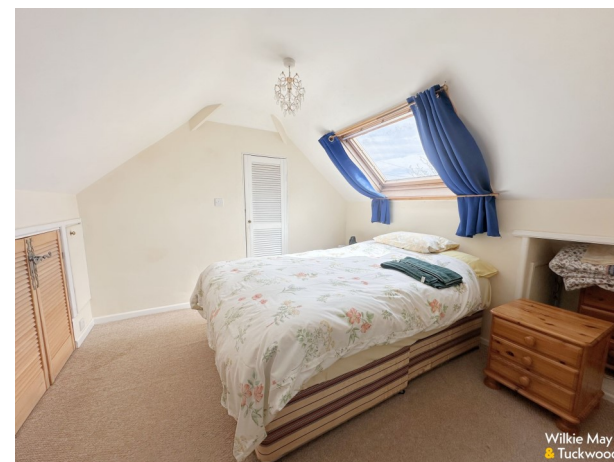
Wilkie May Tuckwood