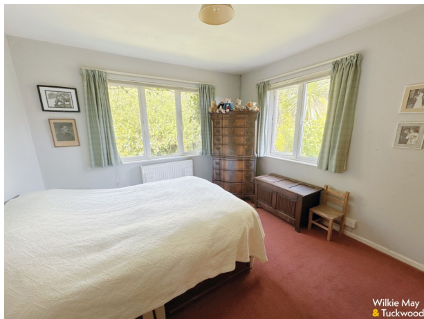
Wilkie May Tuckwood