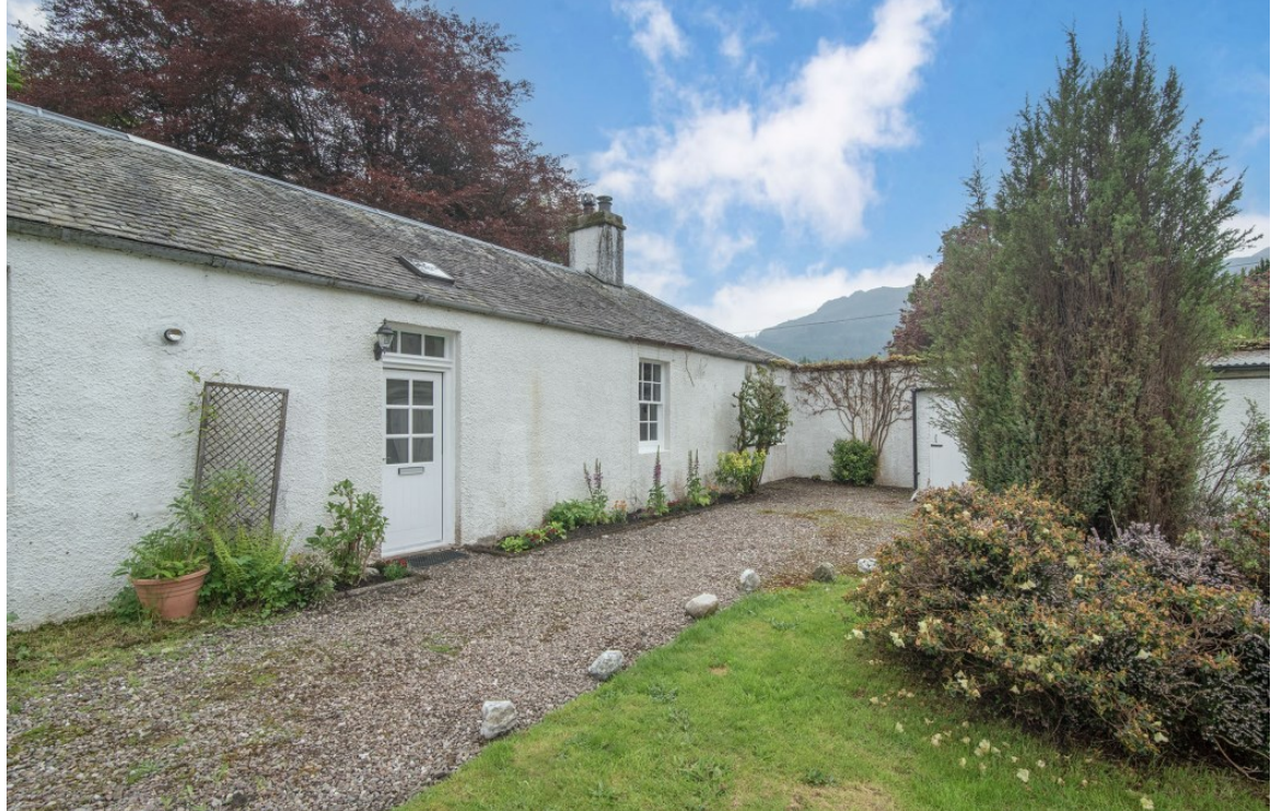
These particulars are believed to be correct, but their accuracy is not guaranteed and they do not form part of any contract. All measurements are approximate only.