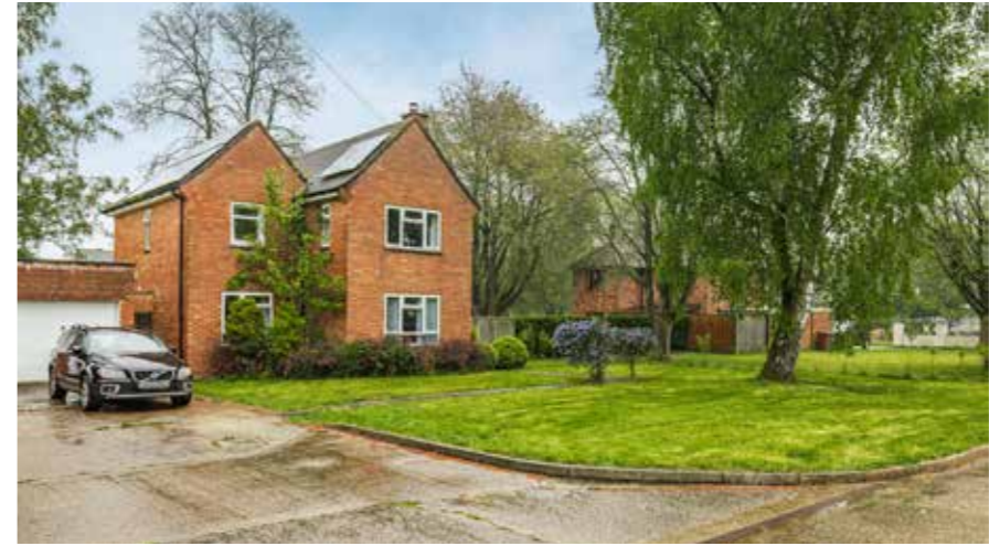
Driveway leading up to 2 Slessor Close

“Beautifully positioned with plenty of potential.”