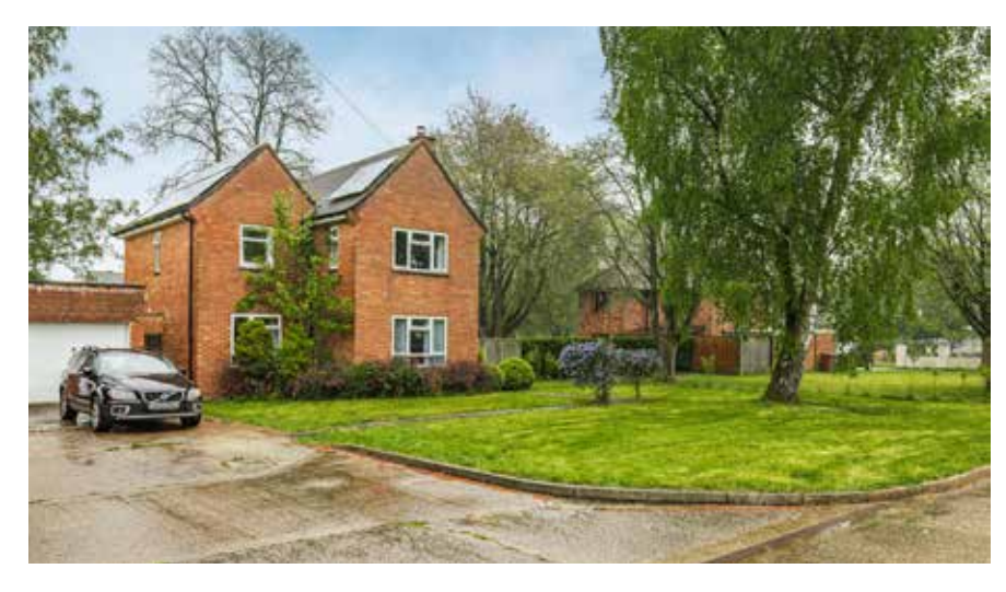
Driveway leading up to 2 Slessor Close

"Beautifully positioned with plenty of potential."