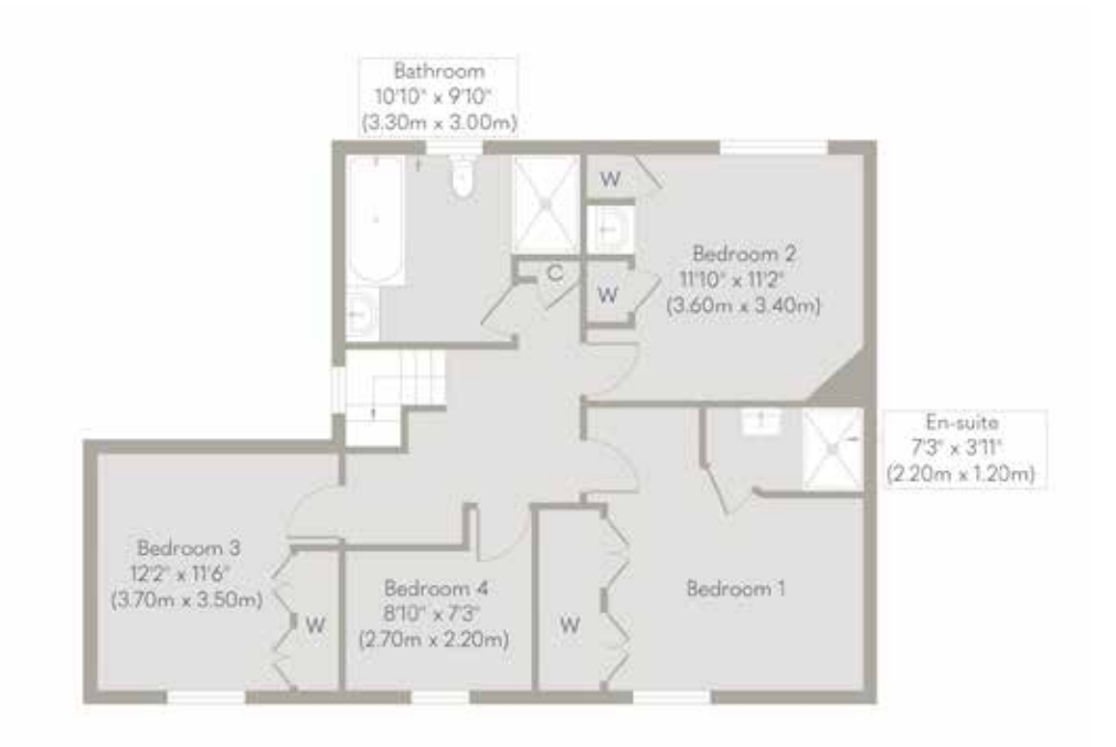
First Floor Approximate Floor Area 754 sq. ft (70.05 sq. m)