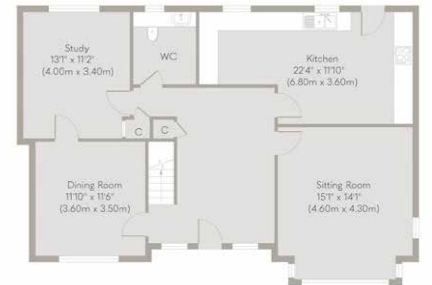
Ground Floor Approximate Floor Area 1,020 sq. ft (94.75 sq. m)

Whilst every attempt has been made to ensure the accuracy of the floor plan contained here, measurements of doors, windows, rooms and any other items are approximate and no responsibility is taken for any error, omission, or mis-statement. This plan is for illustrative purposes only and should be used as such by any prospective purchaser or tenant. The services, systems and appliances shown have not been tested and no guarantee as to their operability or efficiency can be given.