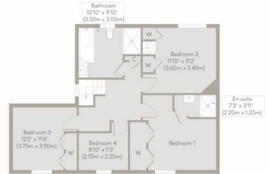
First Floor Approximate Floor Area 754 sq. ft (70.05 sq. m)