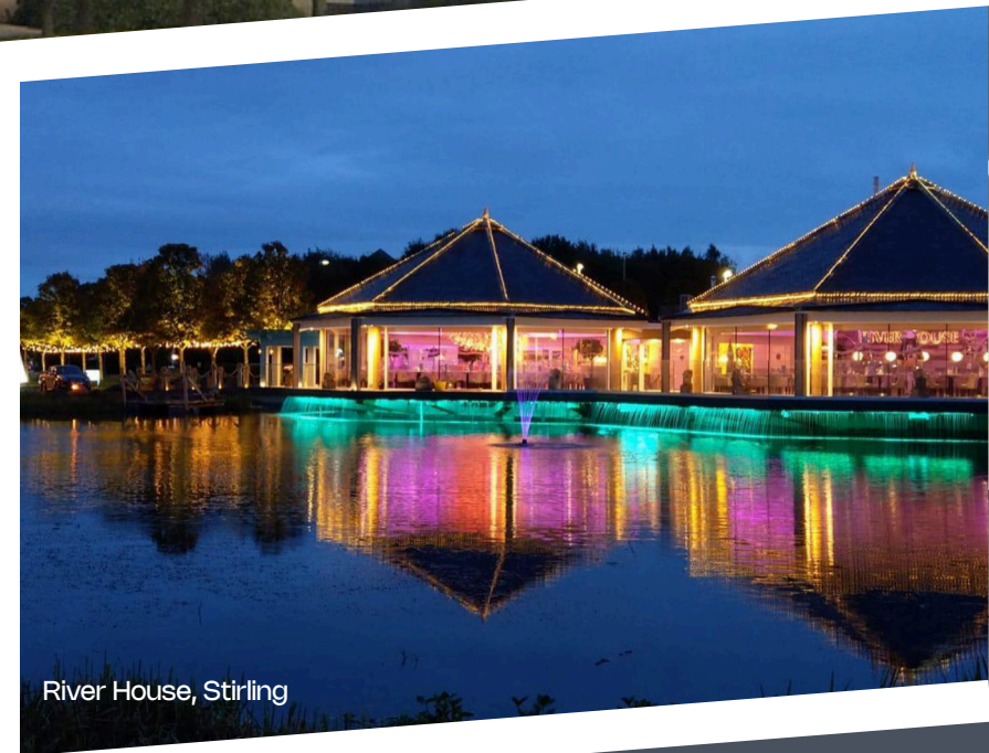
River House, Stirling

The suite is being refurbished and will benefit from a high-quality fit-out providing a series of open plan areas, private offices, meeting rooms, kitchen/break-out space, storage and server room.